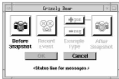
Figure 1. Grizzly Bear's Control Panel.

Giving one example to Grizzly Bear consists of working through its iconic buttons from left to right. One demonstration consists of one or more such examples. After each example, the corresponding textual inference is displayed, and the behavior can be tested interactively by temporarily going into a test drive mode.