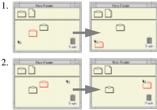
Figure 4. Drag-and-drop: the Motion Event.

Let us thus complete the example by demonstrating that the color of newly created folders reverts to black upon the release event of the drag-and-drop interaction (Figure 5).