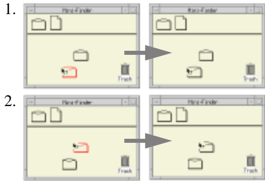
Figure 5. Drag-and-drop: the Release Event.

Let us thus complete the example by demonstrating that the color of newly created folders reverts to black upon the release event of the drag-and-drop interaction (Figure 5).